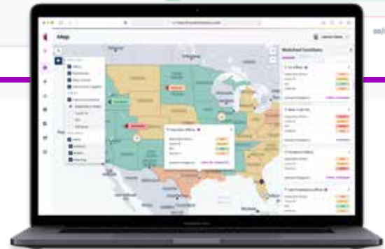
Pharos Platform: Your Early Warning Radar

PHC Pharos is API-first and integrates proprietary intelligence layers into existing customer dashboards and systems to provide a single view of risks. Pharos includes Global Threat Tracker, a dynamic dashboard of current threat levels and alerts customized specifically for your business. Pharos users can filter multiple data points, including