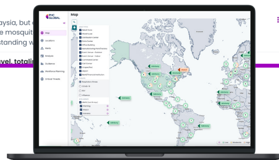
Pharos Platform: Your Early Warning Radar

PHC Pharos is API-first and integrates proprietary intelligence layers into existing customer dashboards and systems to provide a single view of risks. Pharos includes Global Threat Tracker, a dynamic dashboard of current threat levels and alerts customized specifically for your organization's unique needs. Pharos users can filter multiple